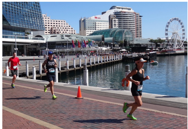
Around Darling Harbour