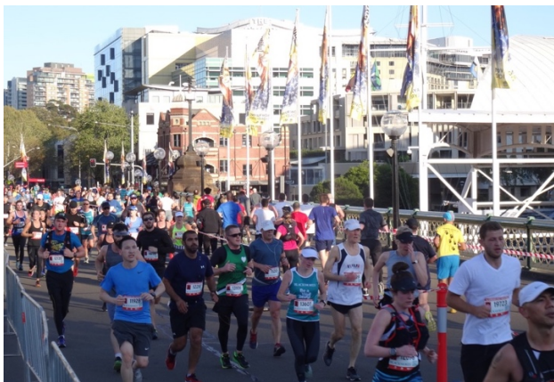
Coming and going on the bridge