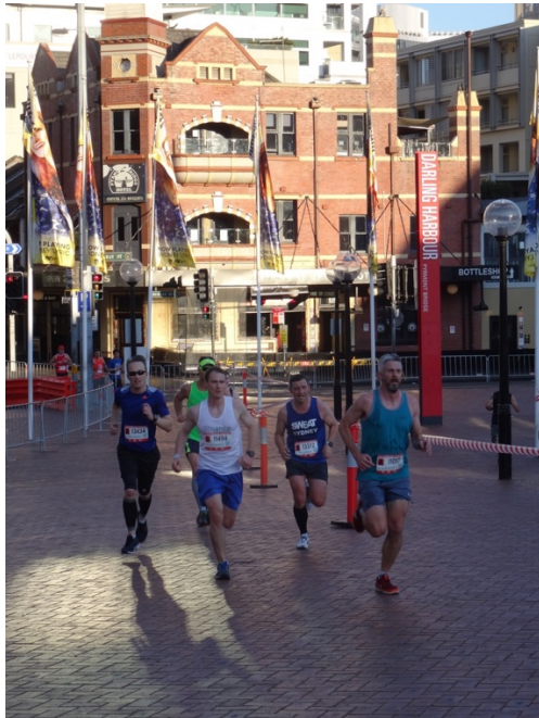
Onto Pyrmont Bridge

Pyrmont is one of the best places in the world to watch a marathon. The runners go back and forth across Pyrmont Bridge, then towards Pyrmont Point and back again under Pyrmont Bridge, around Cockle Bay, then on to the finish at Sydney Opera House.